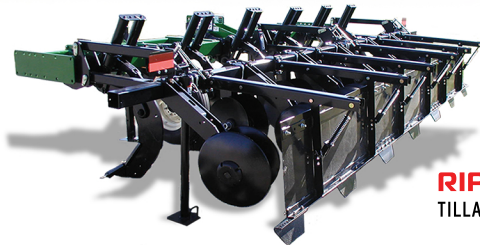
RIPPER BEDDER TILLAGE TOOL

The Ripper-Stripper® tillage tool is the most customizable strip-till machine available. Choose from a lead coupler that clears a path for the shank or a cover crop roller with an 11" diameter drum that crimps and deflects residue away from the row. The deep-till shanks with shark-fin points and wear bars rip through compaction from 9" to 18" deep. Plus, you can choose from the widest variety of attachments to complete the tillage pass.